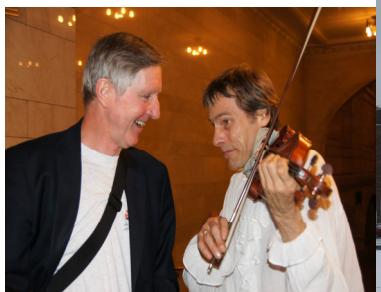
We had a great time with this busker who loved our kiwi accents!!!