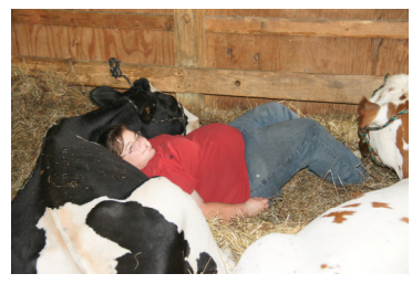
Agricultural show exhibitor.